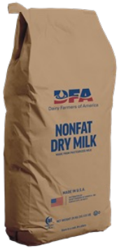
Garden City, Kan. Milk powders and cream