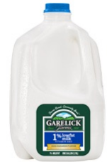
Franklin, Mass. Garelick Farms fluid milk